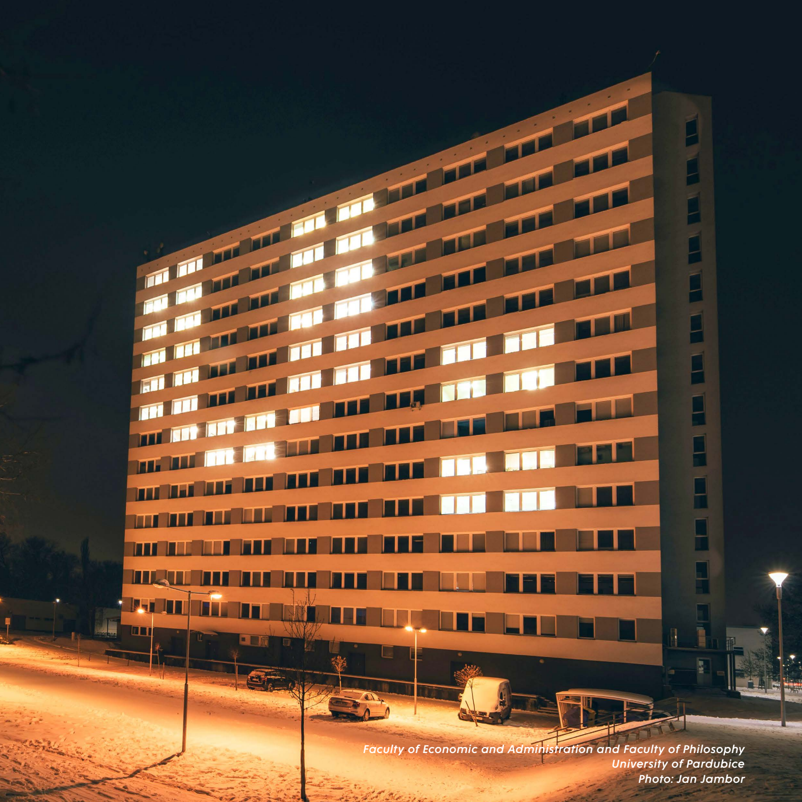
Faculty of Economic and Administration and Faculty of Philosophy University of Pardubice