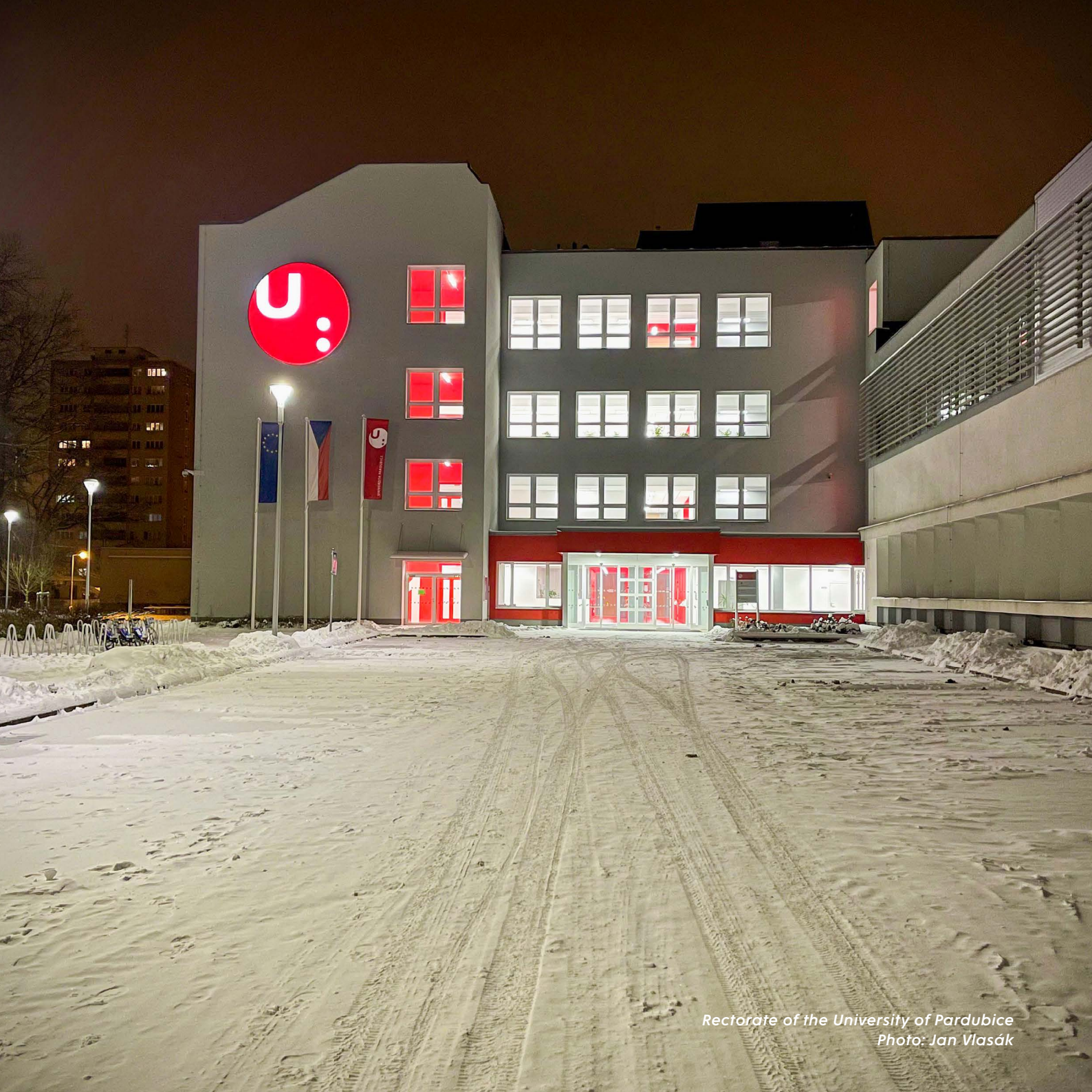
Rectorate of the University of Pardubice