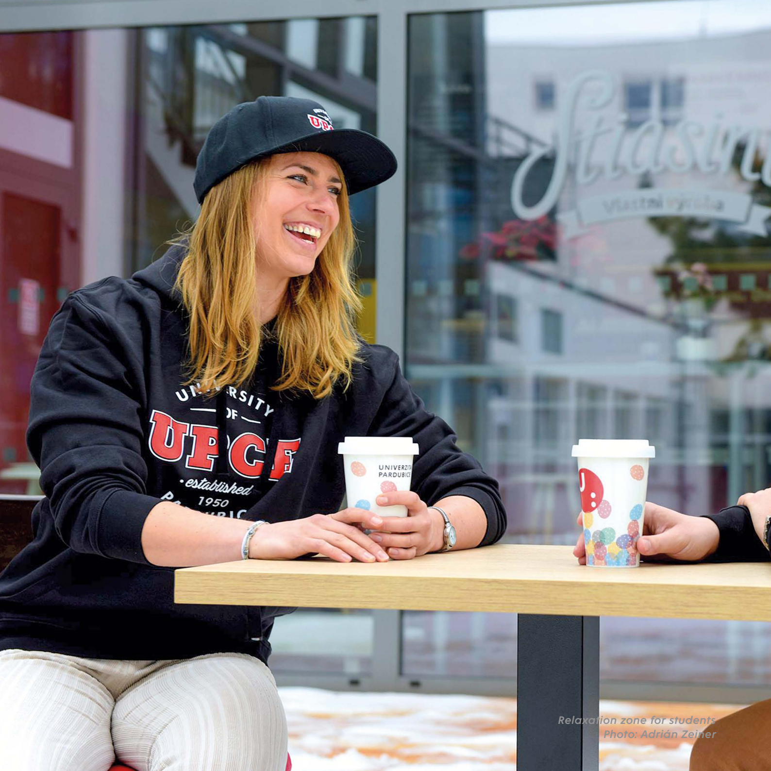
Relaxation zone for students